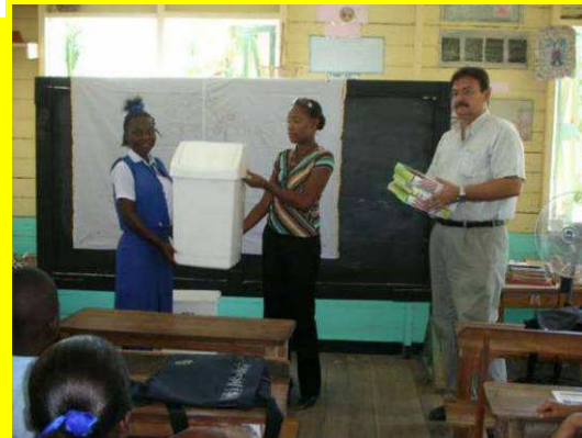
Workshop overview and bin and kit donation by MOH and PAHO representatives